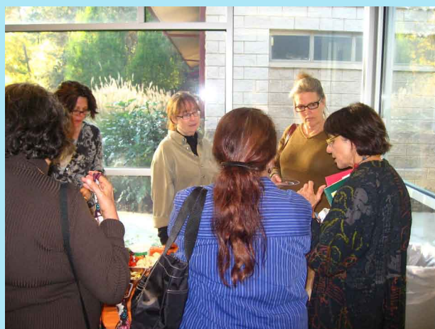
A small group mingling and enjoying some snacks.